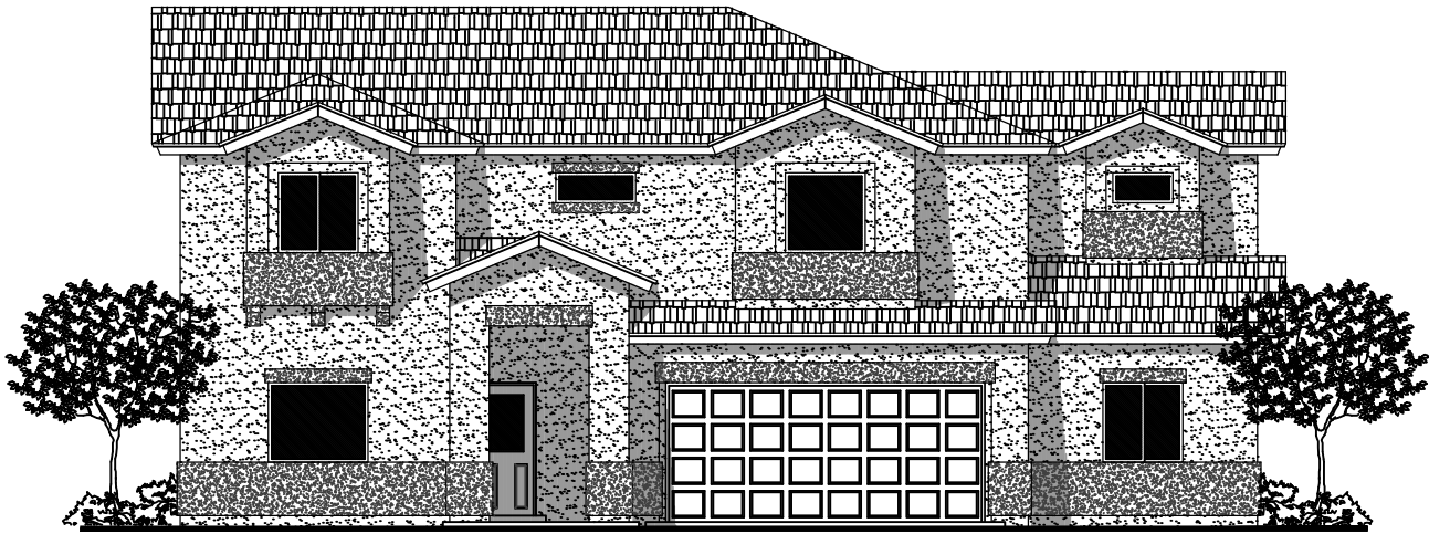
S - ELEVATION