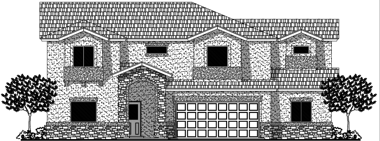
C - ELEVATION (CULTURED STONE)